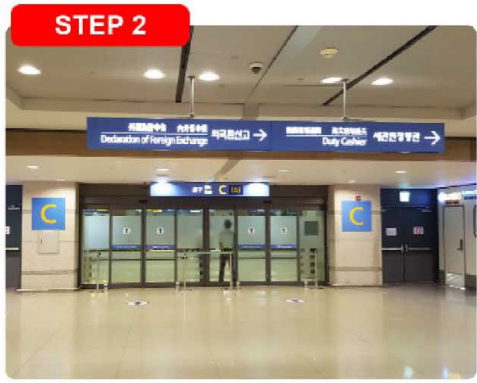
After submitting your custom form, please proceed to EXIT C

STEP 1 Please Submit your customs declaration form to the personnel before you exit