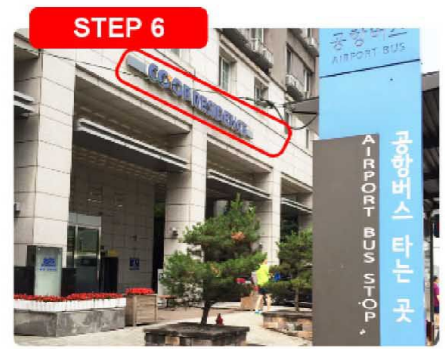
Drop off at the Western or Euljiro Co-op Residence Hotel

AIRPORT BUS From Incheon Airport (6001) First Time : 05:40 am (Every 30 min) Last Time : 10:40 pm To Incheon Airport (6001) First Time : 04:30am (Every 30 min) Last Time : 20:00 *This time is not accurate. It may be changed according to the traffic conditions