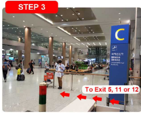
After Exit C, Walk towards building Exit 5, 11 or 12