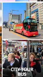
CITY TOUR BUS