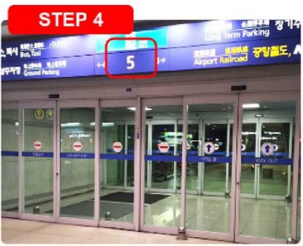
From Exit 5,11 or 12, Look for Bus stop 5B or 11B with the signboard #6001, wait until the arrival of the Bus.